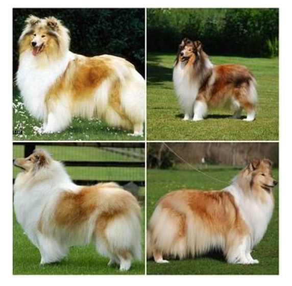
PART 3 - Judging - In Practice

There follows some video of a Rough Collie on the move as it might circle a ring and with our thanks to the owners of all images shared here. Click to play. https://youtu.be/4NMBgZ7jXgE